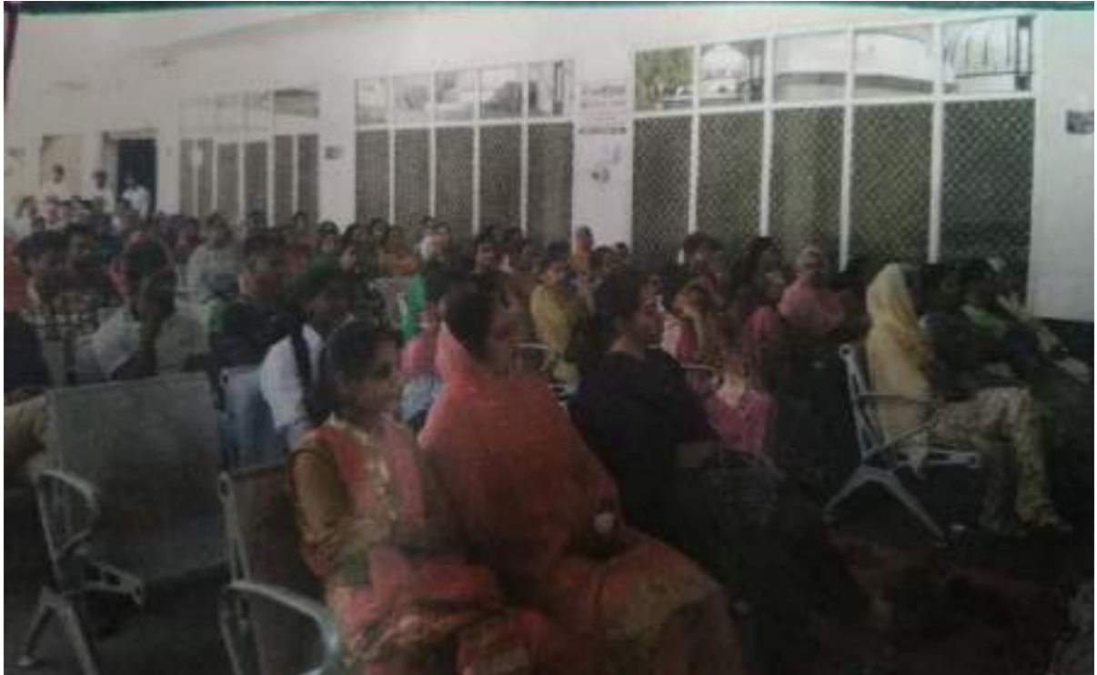
Resident of Village Bhupal during Anti-Drug Awareness and Illicit Trafficking Seminar

promote a safer and healthier community.