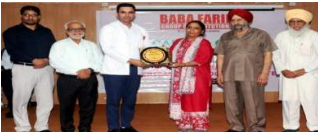
A Glimpse of Cancer Checkup and Awareness Camp