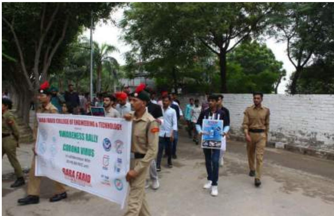
A glimpse of Awareness Rally against Corona Virus