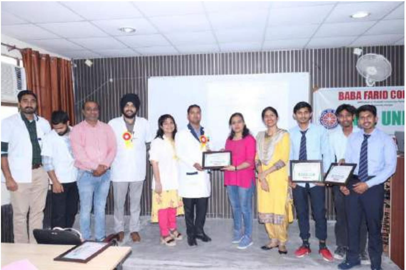
Honouring to Doctor of Adesh University, Bathinda in a Camp