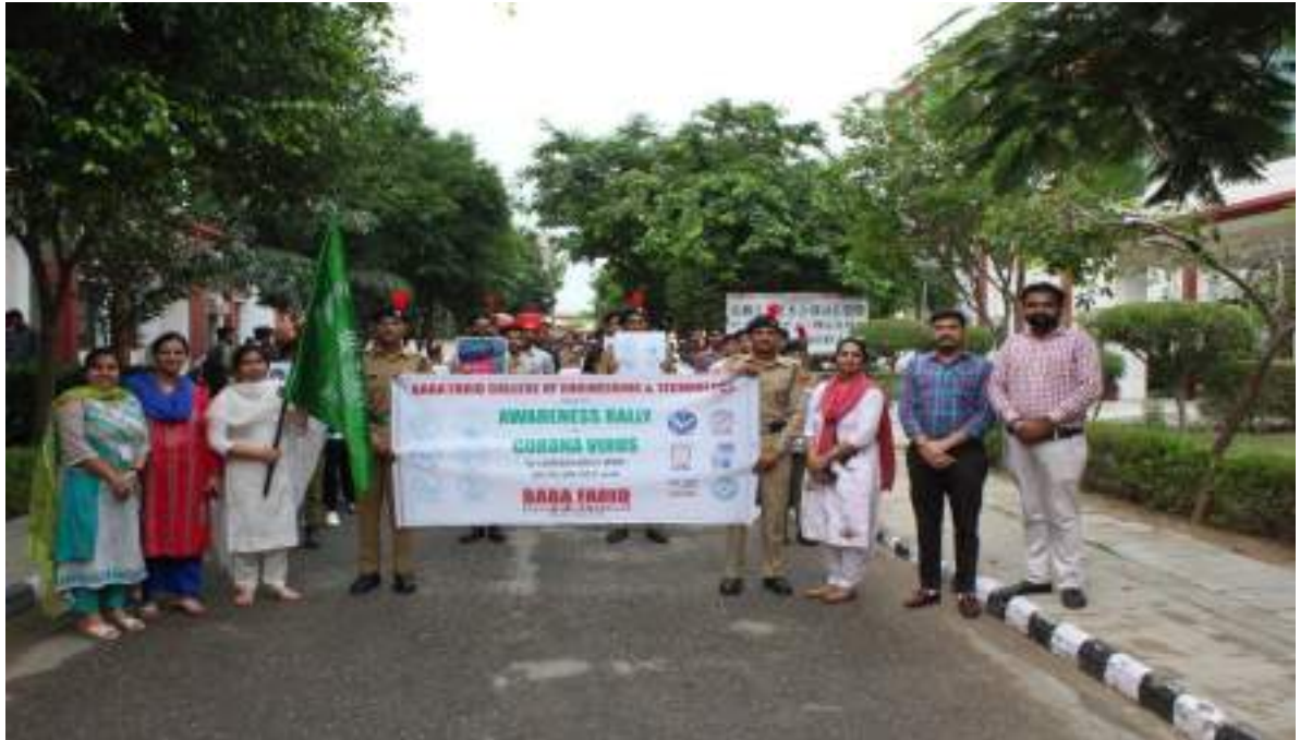
Principal, BFCET raised the flag of Awareness Rally on Corona Virus