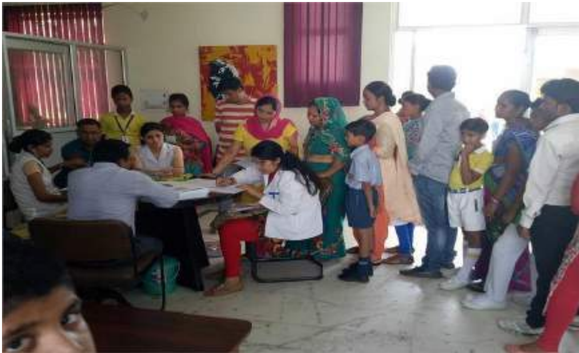
Doctors doing Check up during Hope for Health: One Day Medical Outreach Program

the works for the betterment of the society are their priority and they will do them with dedication. The camp concluded at the positive note. All the attendees were content and happy. They understood that it was an important camp and such camps should be organized time by time.