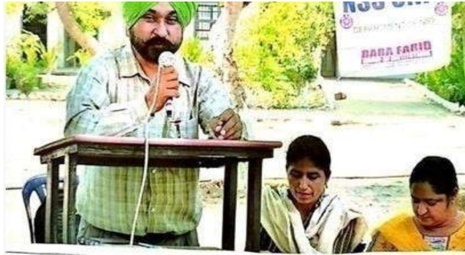
Glimpse of Anti-Drug Awareness Seminar

well received by all. Overall, it was an informative and eye-opening experience for everyone who attended the seminar. In the end, Sarpanch, and Gram Panchayat thanked the speakers and volunteers of the NSS unit, for coming up with this kind of initiative.