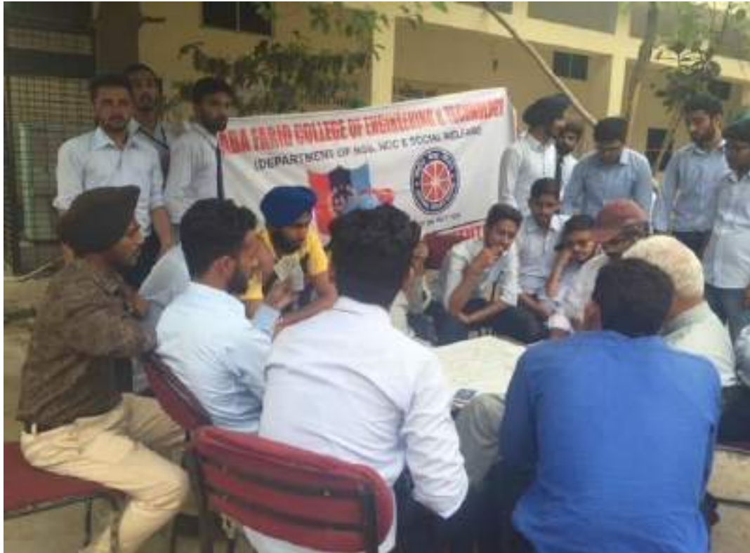
Students playing cards with Old Age Home Inmates

compassion can make a big difference in the lives of others.