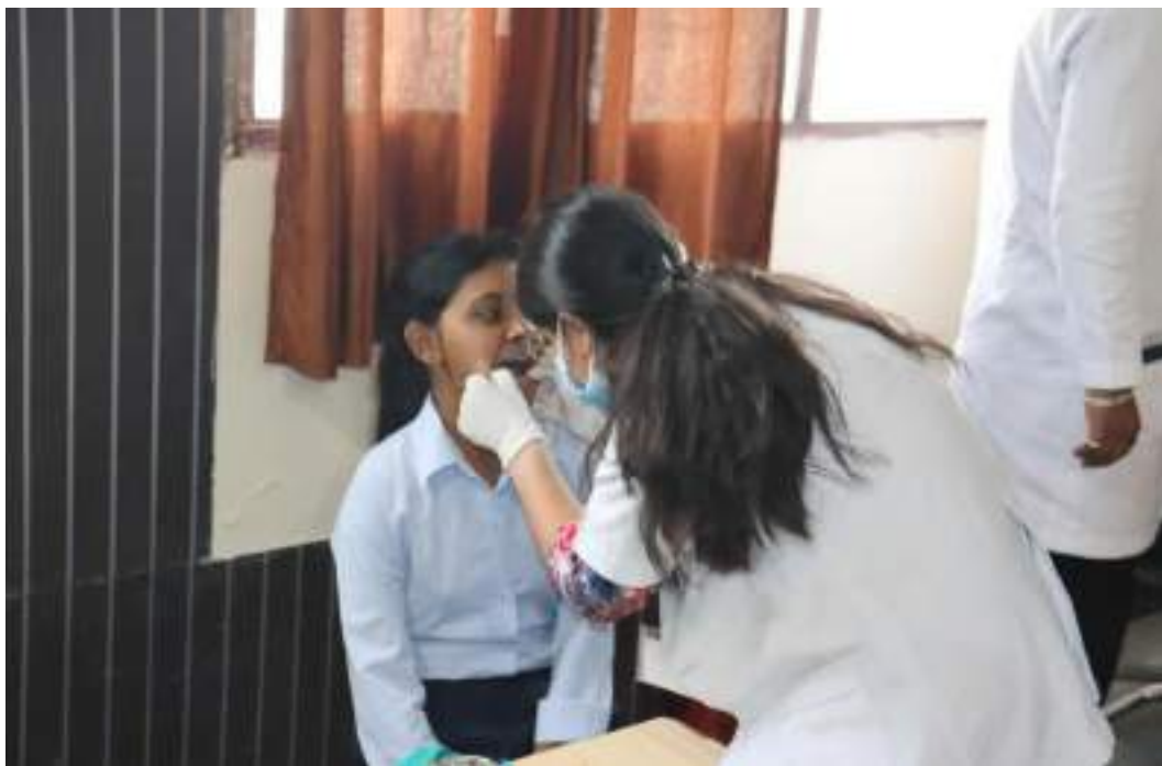
Doctors doing Check up during the Camp