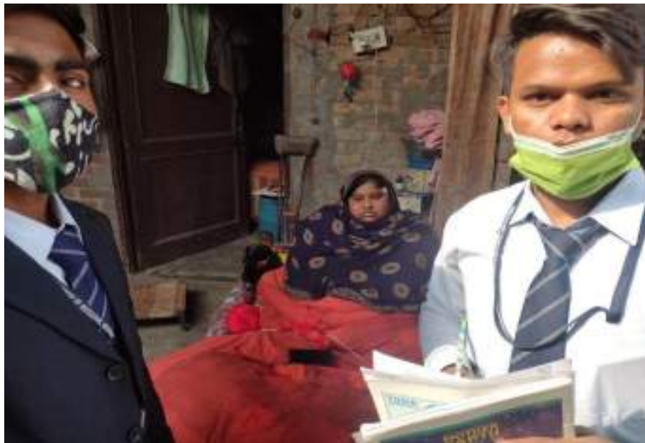
Glimpses of Village Survey under Unnat Bharat Abhyaan