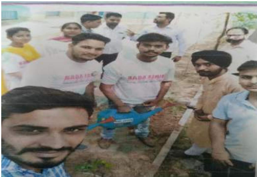
Volunteers during the Plantation Drive