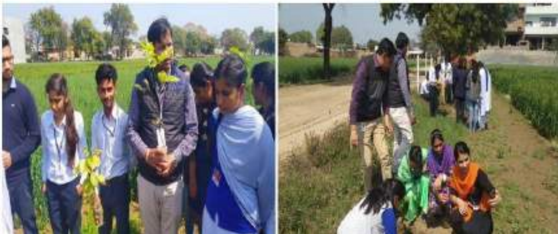
Tree plantation at Village Maha Badhar:- Students involved in planting plants

Principal, BFCET interacted with the students and motivated them by saying that tree plantation connects the students to the benefits of trees and fosters environmental stewardship. He said that Baba Farid College of Engineering & Technology always had a strong vision and commitment to the service of society. He also explained the significance to both the volunteers and society as a whole. Students took active role in the activity and spread a message of environmental preservation. The volunteers worked tirelessly to plant a variety of trees, including neem, peepal, banyan, and mango Tamarindus Indica etc. Each tree was dedicated to a local resident who had taken part in the planting process, and they had pledged to care for their designated tree. In total, over 40 trees were planted by a combination of teachers, volunteers, and community members. Tree plantation was done on different locations suggested by village Sarpanch and completed successfully. Students shared that tree planting activity was a learning experience.