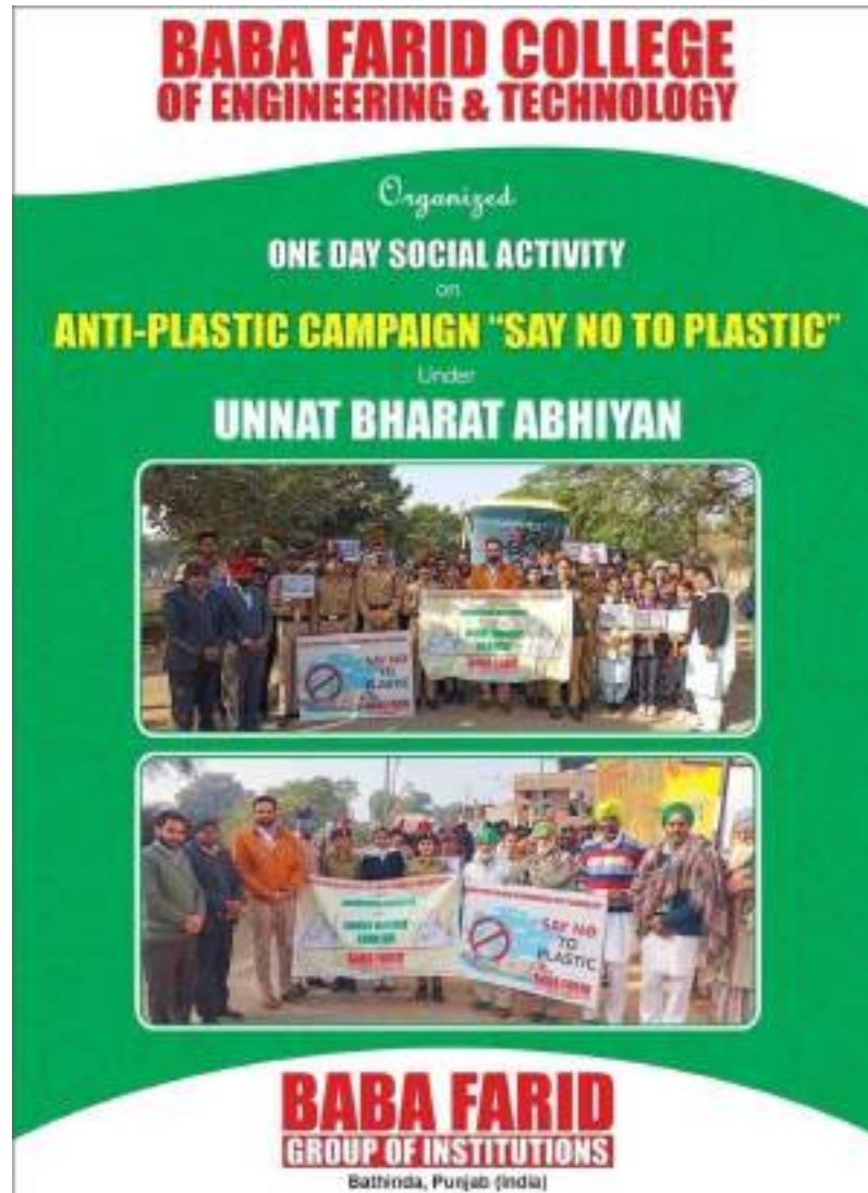
Social Media Post of Awareness Rally on Say No to Plastic