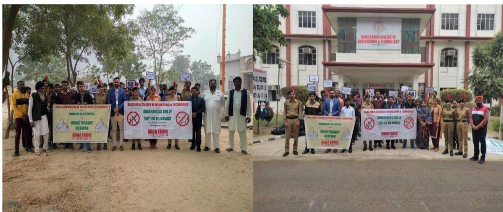
A Glimpse of Awareness Rally on ‘Say No to Drugs’

In the end, it's up to the individual to make that decision, but as responsible citizens who care about the future, this is the least we can do. The public responded enthusiastically to the campaign, and students helped spread the word about the negative effects of drug use and misuse.