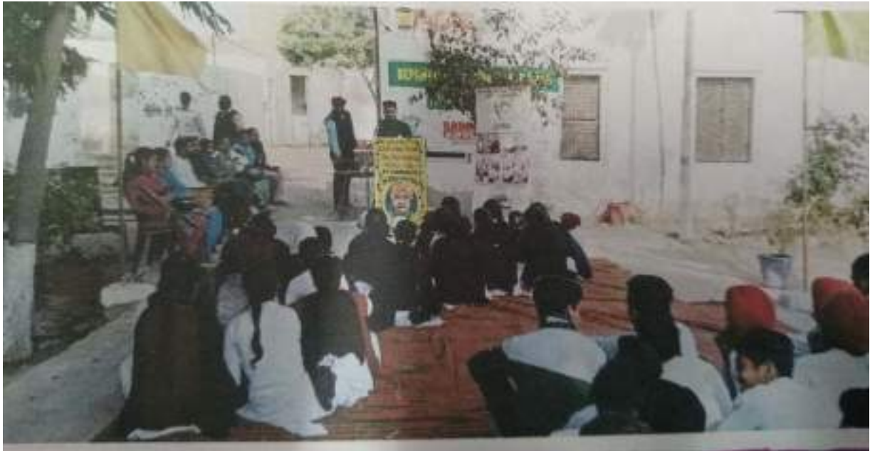
The students of the Government Senior Secondary School listening to the speaker in Seminar