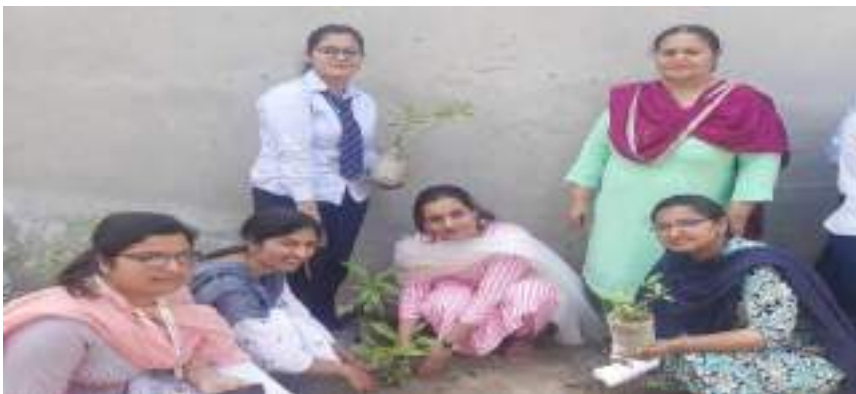
A Glimpse of One Day Eco Restoration Camp