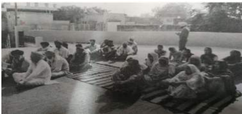
Seminar on Women Rights at Daula: Local Residents showing their keen interest in understanding the various gender issues& related challenges in the rural areas