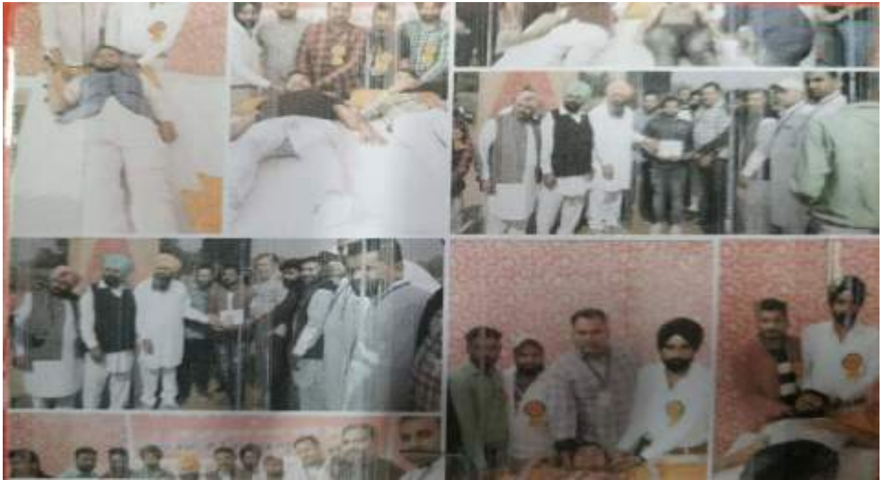
Glimpses of Blood Donation Camp at Village Daula