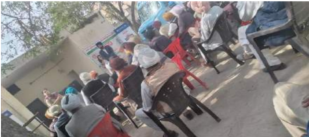
Glimpse of Awareness Drive on Social Evils