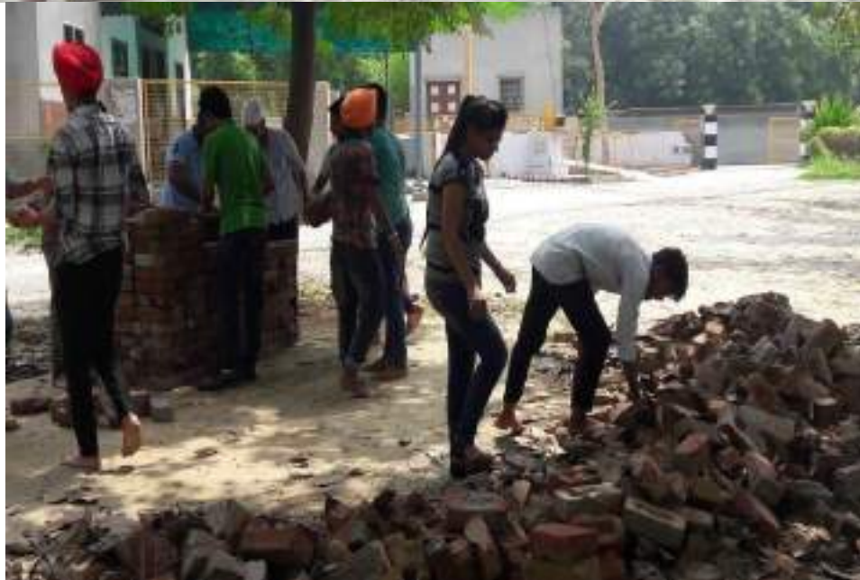
Volunteers during the Cleanliness Drive at Dera Baba SidhTilkara, Deon