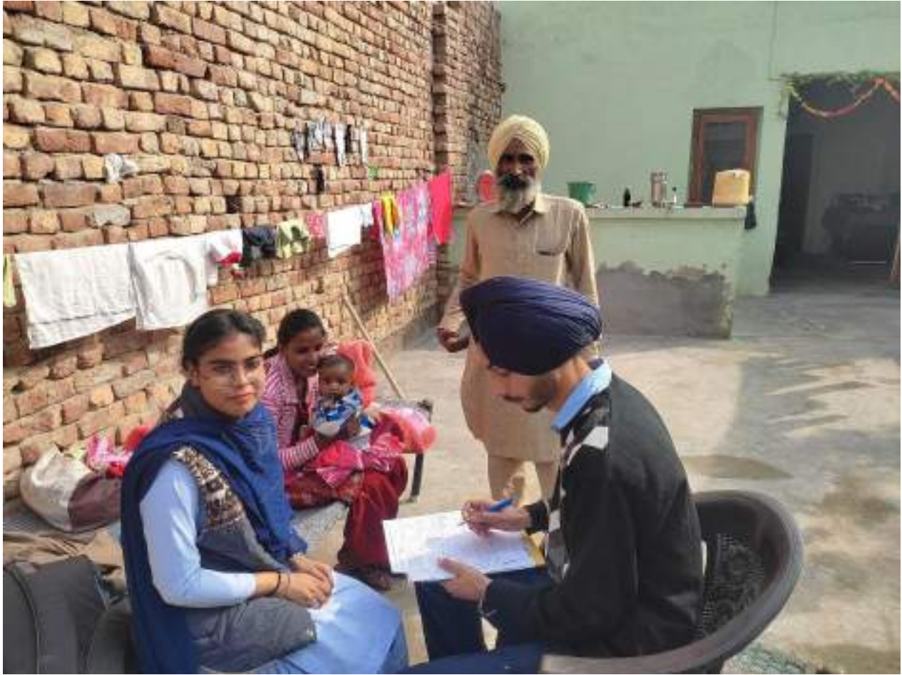
Glimpses of Village cum Household Survey under Unnat Bharat Abhyaan