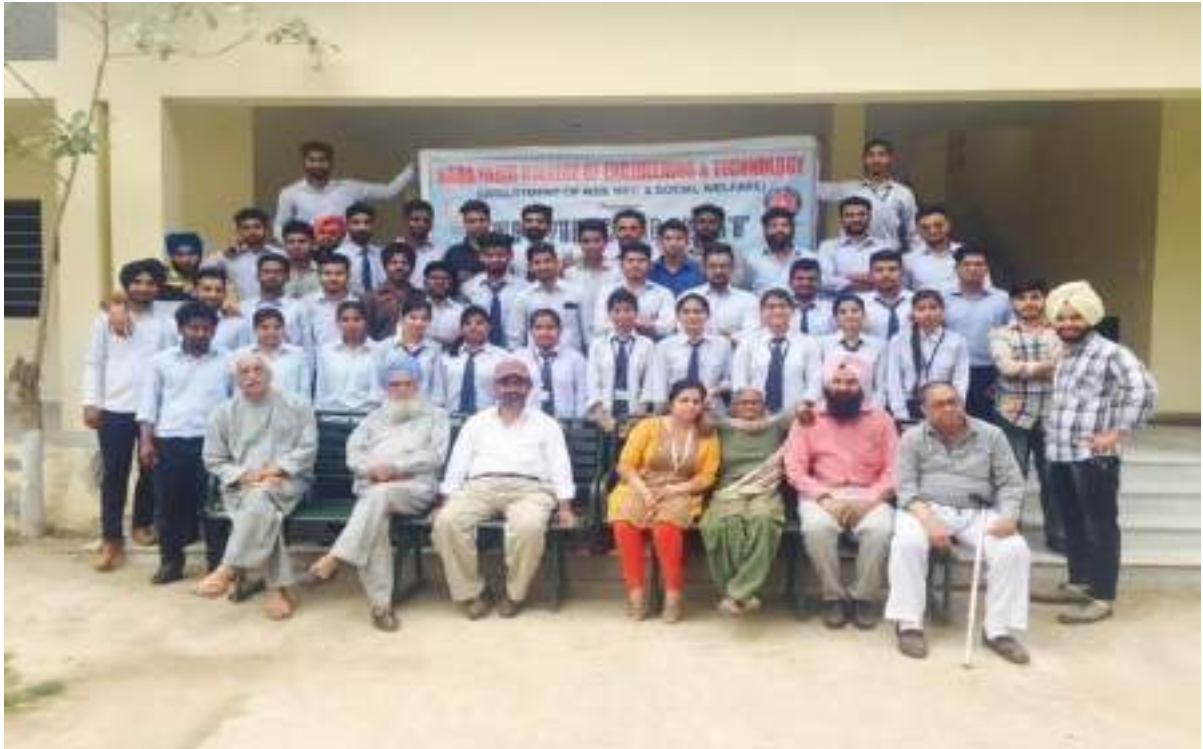
Students with resident of Old Age Home: A memorable moment for all