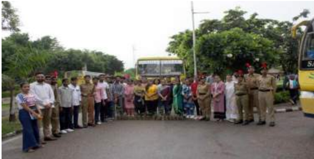
Student Ready to Move for Tree Plantation Activity at Peori Village