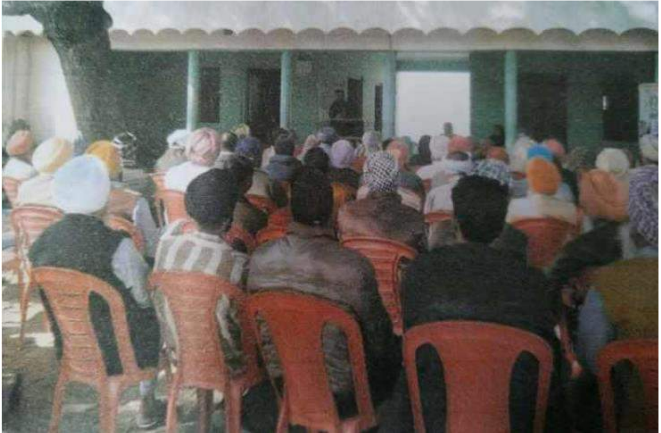
Local Community attending the Exploring Contemporary Challenges: A Seminar on Social Issues