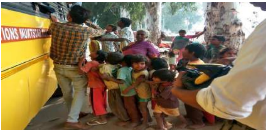
Cloth Distribution in the Slum Areas: Children Getting the Clothes