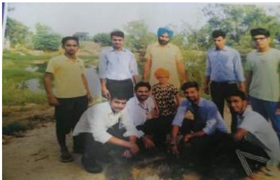
Volunteers plant the Tree during this Tree Plantation Drive