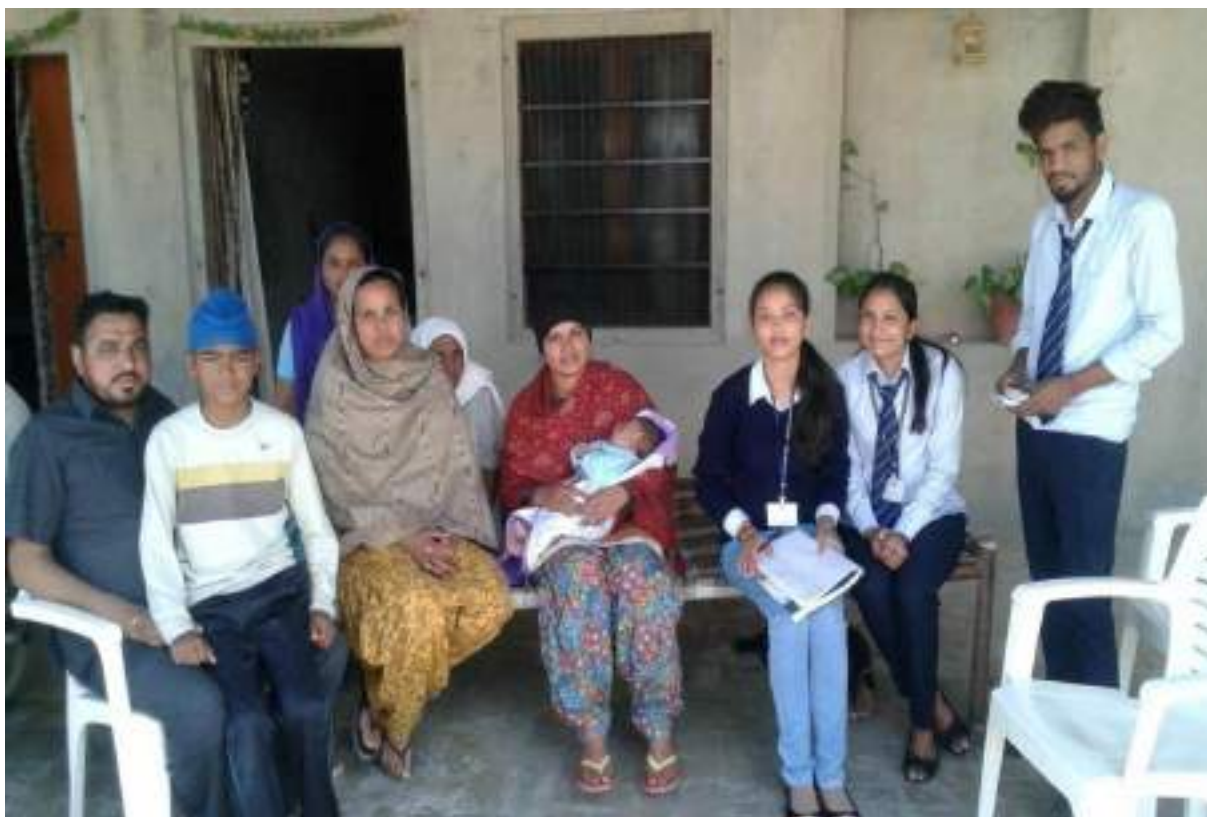
Stop the Bug: Stop the Flu: Students seed happiness by creating awareness & distributing medical kits to the needy