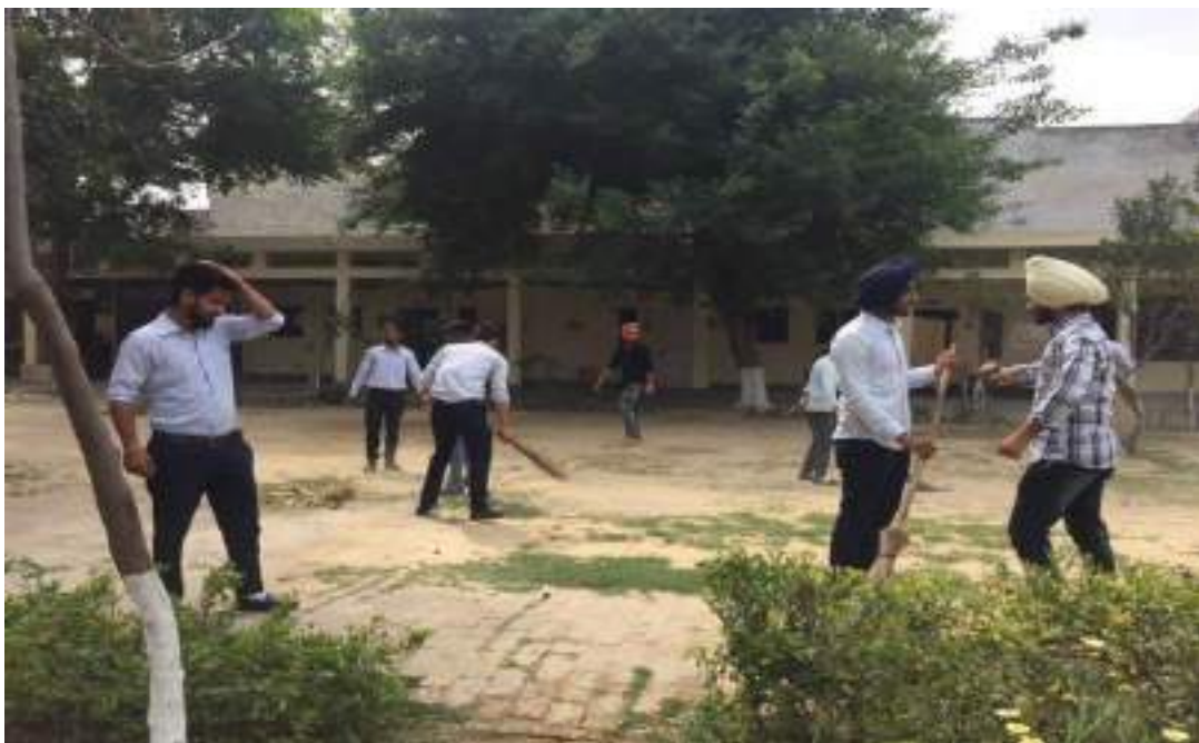
Students Cleans the Surrounding at Old Age Home, Bathinda