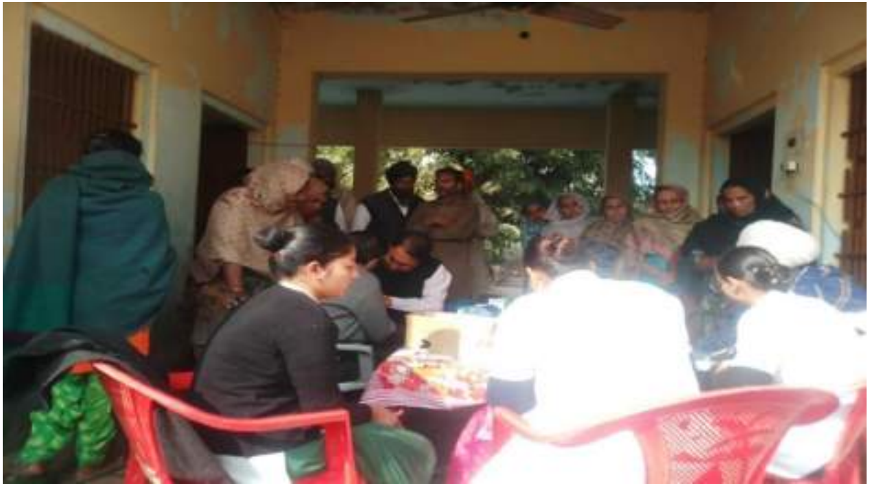
A team of doctors attending the patients during Health awareness camp