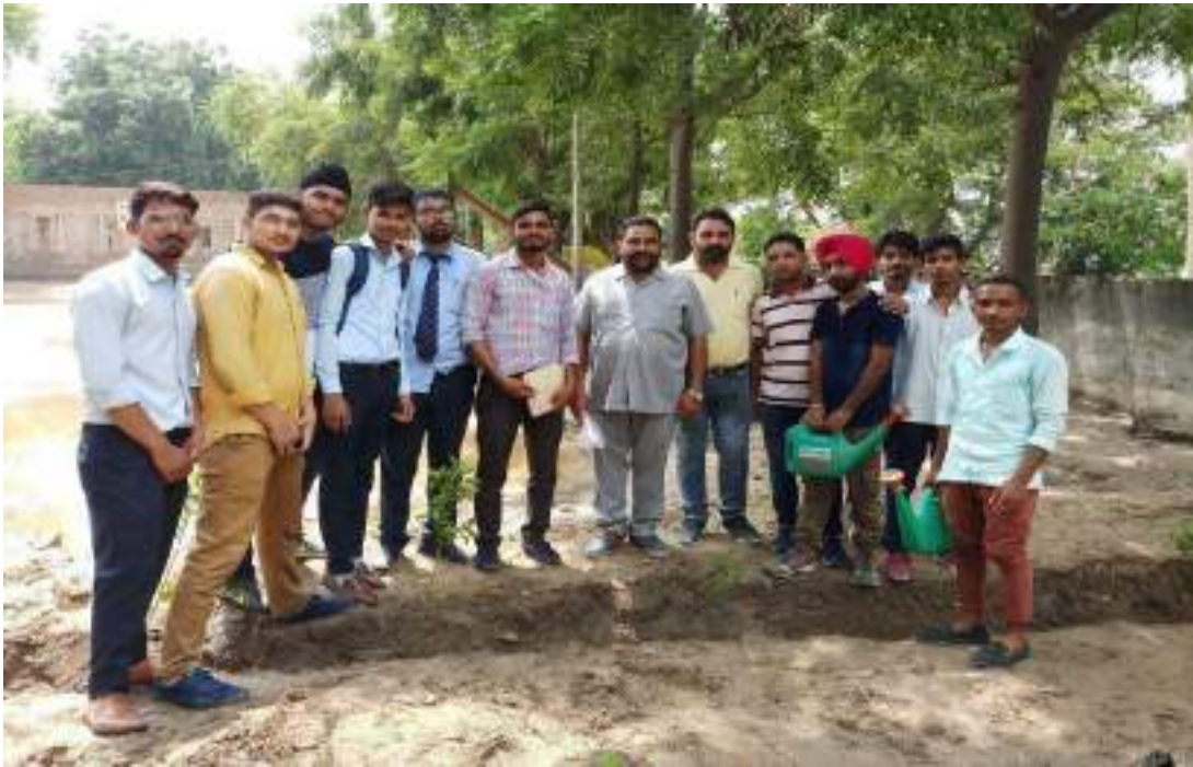
Volunteers during Tree Plantation at Village SanguDhoun