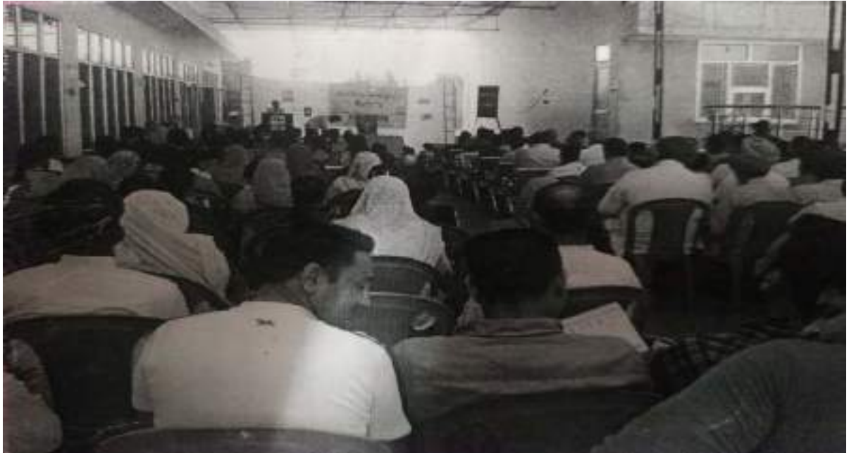
Local Community getting of all the social evils prevailing in the society at Akalia