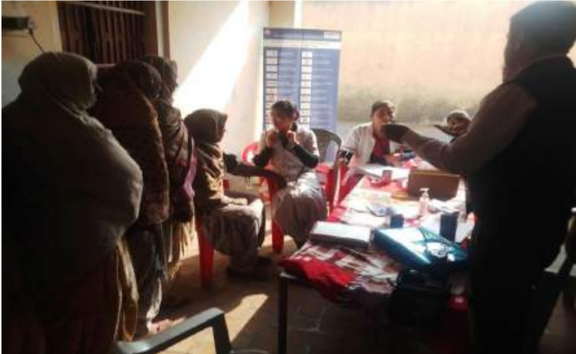
Resident of Village Jangirana took benefit by getting Advice from the Doctors along with the Medical Kits