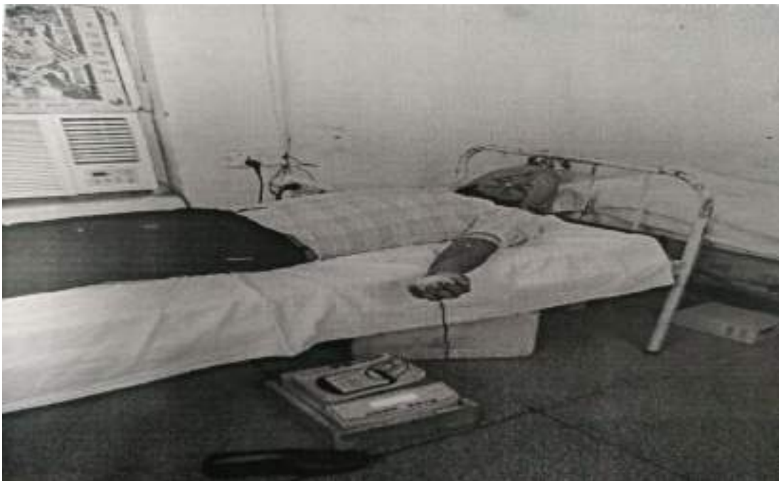
Glimpses of Blood Donation Camp