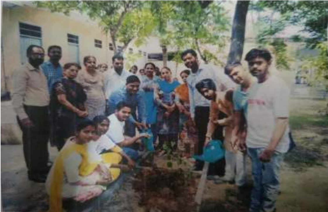
Volunteers plants Tree at Govt. Sen. Sec. School, Ubha in the presence of School Staff