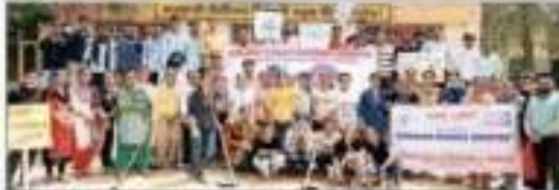
ਸਰਕਾਰੀ ਸਕੂਲ ਦੀ ਸਫਾਈ ਕਰਦੇ ਹੁਏ ਬਾਬਾ ਫਰੀਦ ਗੁਪ ਕੇ ਵਿਦਿਆਰਥੀ।

ਬਠਿੰਡਾ (ਮਾਂਡੀਆ): ਸਵੱਛ ਭਾਰਤ ਦੇ ਲਿਏ ਦੇਸ਼ ਭਰ ਮੇਂ ਯੁਵਾਓਂ ਕੋ ਯੋੜਨੇ ਆਰ ਉਨਕੇ ਫੂਨਰ ਆਰ ਵਿਕਾਸ ਕੇ ਲਿਏ ਭਾਰਤ ਸਰਕਾਰ ਨੇ ਸਵੱਛ ਭਾਰਤ ਸਮਰ ਇੰਟਰਨੈਸ਼ਿਪ ' 100 ਘੰਟੇ ਦੀ ਸਵੱਛਤਾ' ਮੁਹਿਮ ਸ਼ੁਰੂ ਕੀ ਗਈ। ਇਸ ਮੁਹਿਮ ਮੇਂ ਸਭਸੇ ਮੁਹਿਮ ਭਾਗ ਲੈਣ ਵਾਲੇ ਭਾਰਤ ਦੇ ਫਰ ਯੁਵਾਓਂ ਕੋ ਜ਼ਰੂਰਤ ਹੈ। ਇਸ ਪ੍ਰੋਗਰਾਮ ਕਾ ਉਦੇਸ਼ 31 ਜੁਲਾਈ 2018 ਤਕ 100 ਘੰਟੇ ਲਗਾਕਰ ਸਮੇਂ ਸਿਰ ਖੇਤਰ ਮੇਂ ਸਮਾਜ ਸੇਵਾ ਕੇ ਲਿਏ ਯੁਵਾਓਂ ਕੋ ਯੋੜਨੇ ਆਰ ਇਸ ਸਵੱਛਤਾ ਕਾਮਿਏ ਕੇ ਲਿਏ ਮਹੱਤਵਪੂਰਨ ਯੋਗਦਾਨ ਦੇਣ ਹੈ। ਬਾਬਾ ਫਰੀਦ ਕਾਲਜ ਆਫ ਇੰਜੀਨੀਅਰਿੰਗ ਆਰ ਟੈਕਨਾਲੋਜੀ ਕੇ 160 ਤੋਂ ਵਧੇਰੇ ਵਿਦਿਆਰਥੀਆਂ ਨੇ ਆਪਣਾ ਨਾਮ ਇਸ ਸਵੱਛ ਭਾਰਤ ਸਮਰ ਇੰਟਰਨੈਸ਼ਿਪ ਕੇ ਲਿਏ ਦਰਜ ਕਰਵਾਏ ਹੈ। ਪ੍ਰਾਯੋਗ ਵਿਦਿਆਰਥੀਆਂ ਨੇ ਆਪਣੇ ਸਾਥੀਆਂ ਨੂੰ ਆਰ ਟੈਕਨਾਲੋਜੀ ਕੋ ਸਕਰਨਕਮਕ ਰੰਗ ਕੇ ਸਾਥ ਆਪਣਾ ਕਰ ਇਸ ਮਿਸ਼ਨ ਮੇਂ ਆਪਣਾ ਯੋਗਦਾਨ ਦੇਣੇ ਕੀ ਕਸਮ ਠਹੇਰੀ।