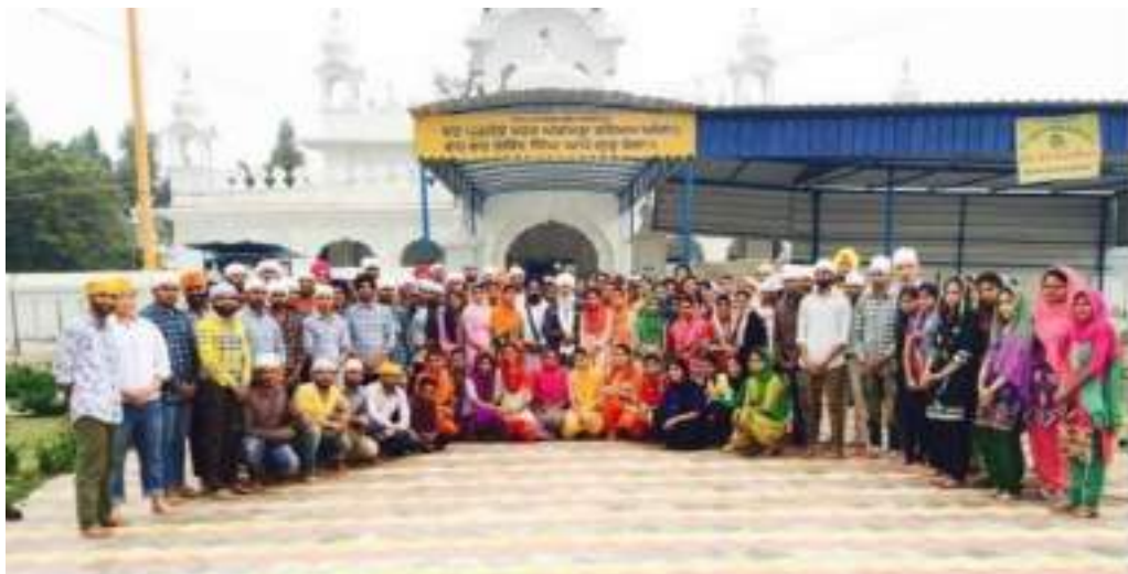
Cleanliness Camp at Gurudwara Thehri Sahib, Malout: Volunteers who participated in this Cleanliness Drive