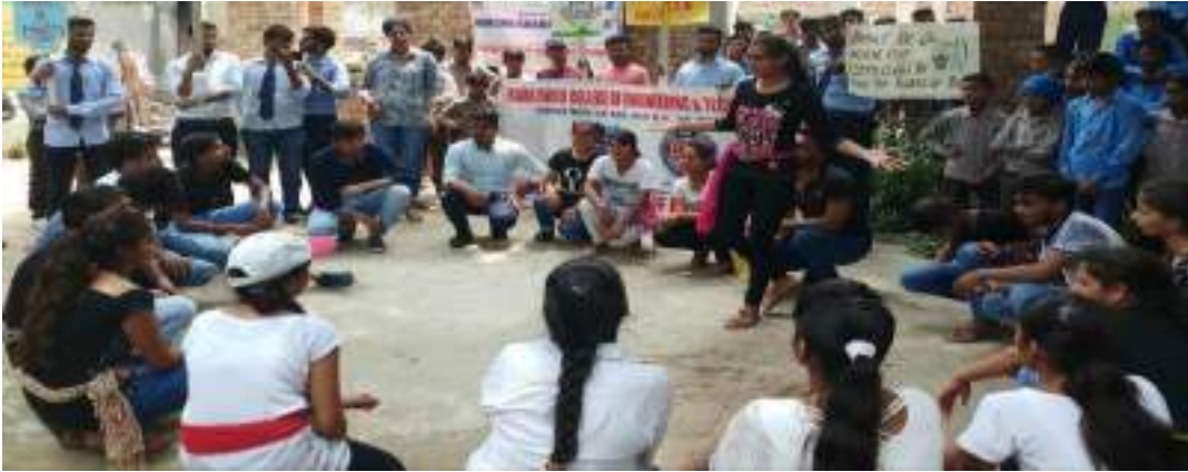
NCC Volunteers playing a Nukkad Natak to focus on the need of maintaining Swachhta at Govt. Sen. Sec. School, Deon

The government and other stakeholders must continue to work together to address these challenges and to ensure that the School Sanitation Program is implemented effectively.