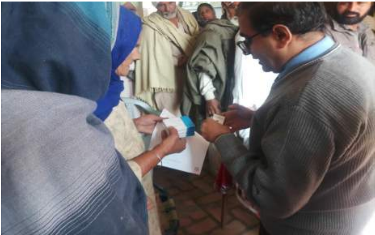
Villagers took benefit by getting the advice from the Doctors along with the Medical Kits in a Health awareness camp