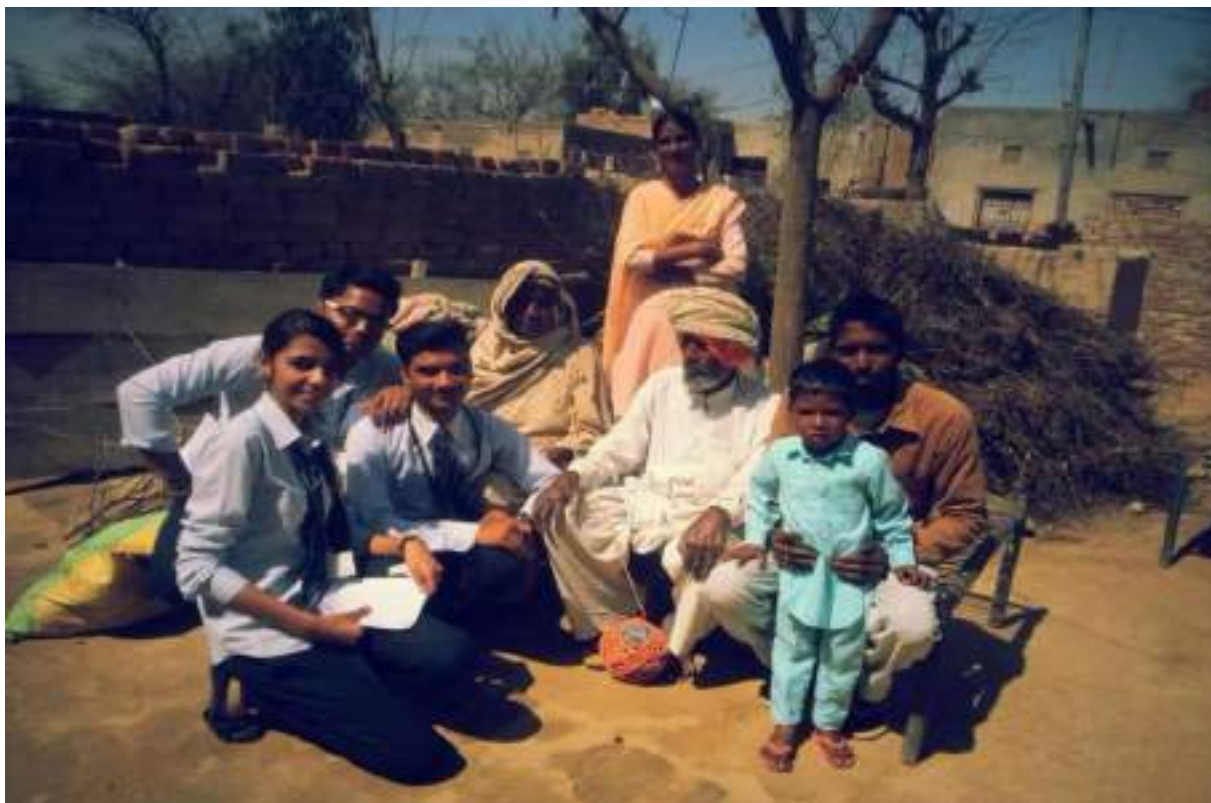
Stop the Bug: Stop the Flu: Students interacting & creating awareness about Swine flu during door to door Campaign in the Village