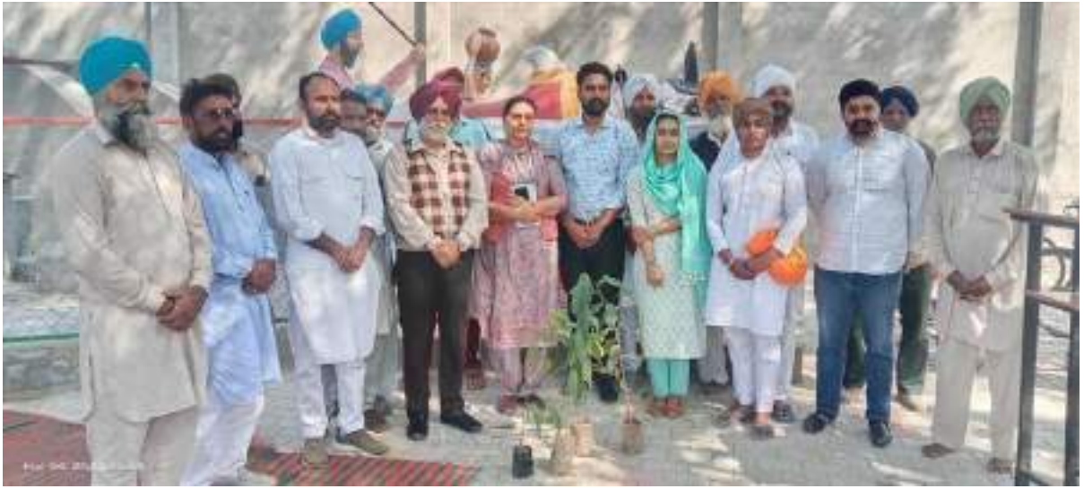
Team members along with resident of Village Aklia during Tree-Planting Drive