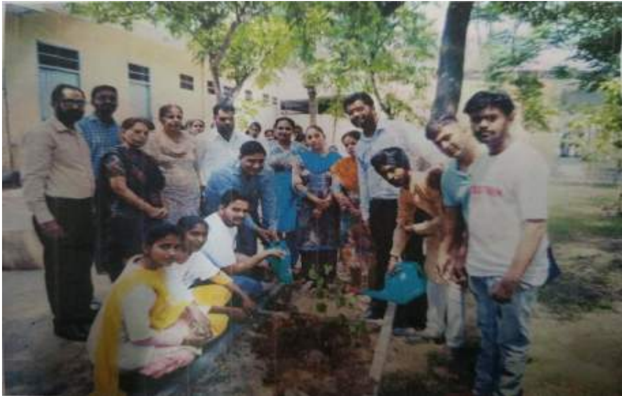
Volunteers plant trees at Govt. Sen. Sec. School, Bhupal in the presence of School Staff