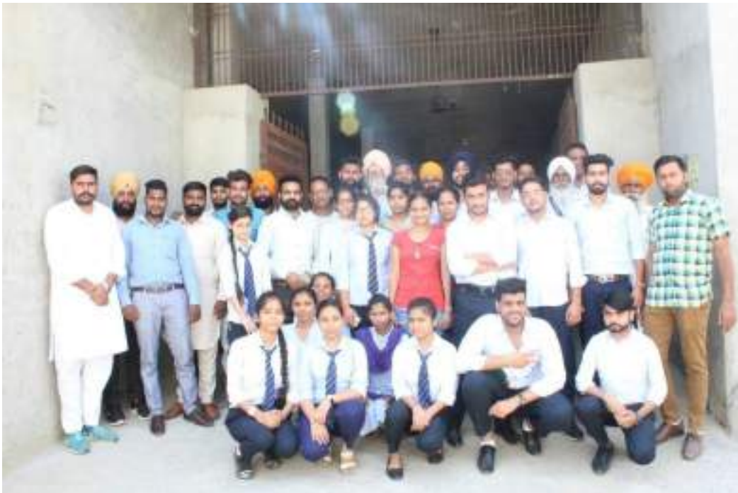
Volunteers Students with Club members & residents

continue to spread awareness about the harm caused by the cutting down of trees. The conclusion of the Tree Plantation event was met with an overwhelming sense of satisfaction and pride among all involved. The collective effort towards doing something beneficial for nature was a source of joy for everyone, and the locals and NGO members were quick to appreciate each step of the program. Buoyed by the success of the initiative, the volunteers pledged to continue their efforts with the same level of inspiration, enthusiasm, and zeal, with the aim of making a positive impact on the environment and enhancing the beauty of mother nature.