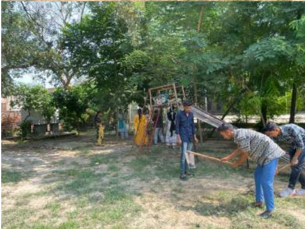
Glimpses of One Day Cleanliness & Awareness Camp