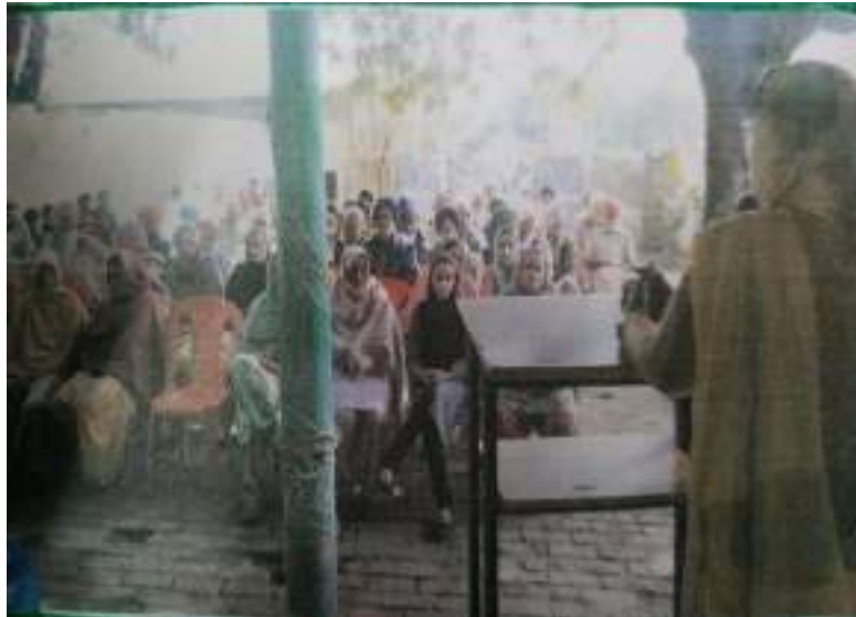
The local Community getting aware of all the social evils at Village Khunan Kalan