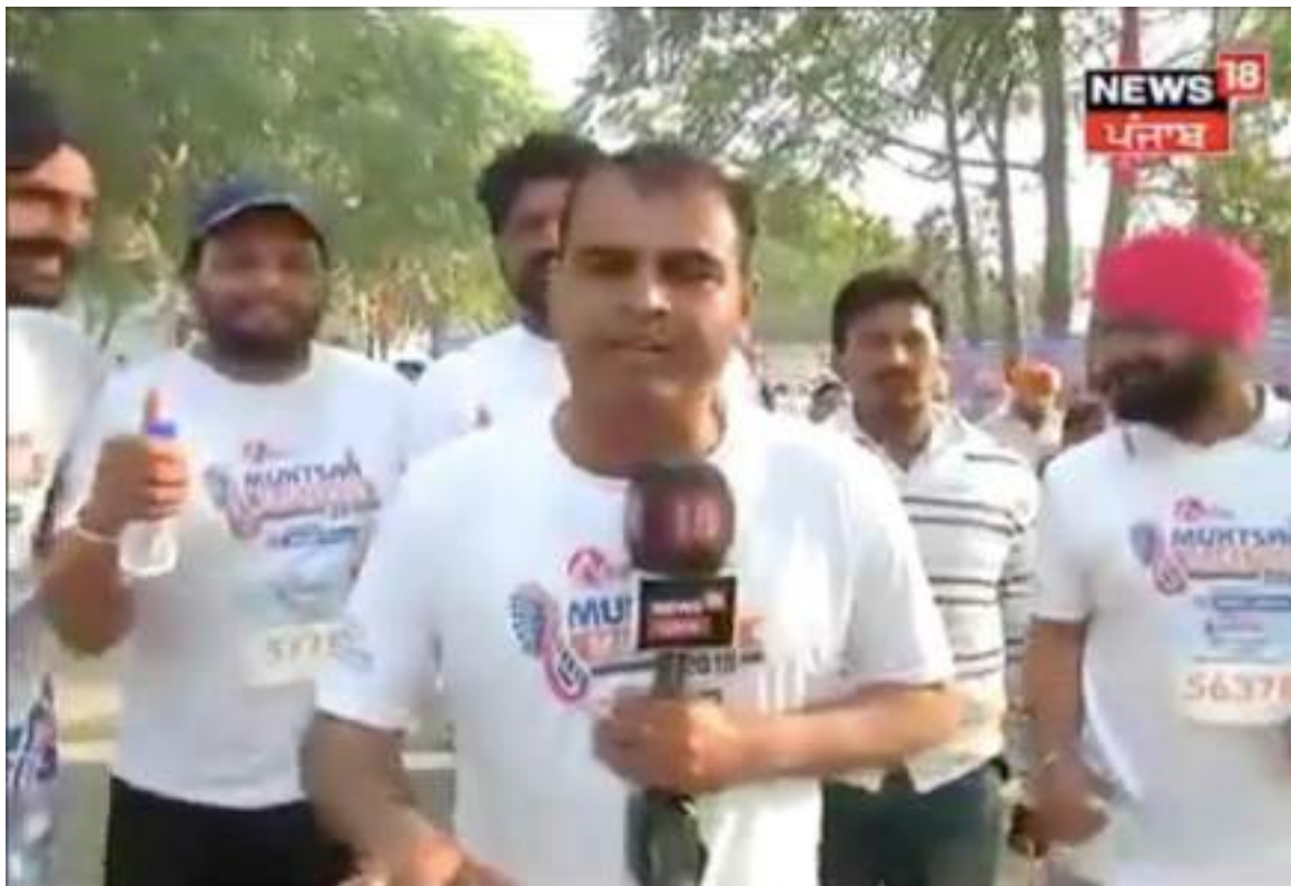
Muksar Marathon 2018: One more glimpse from This Marathon