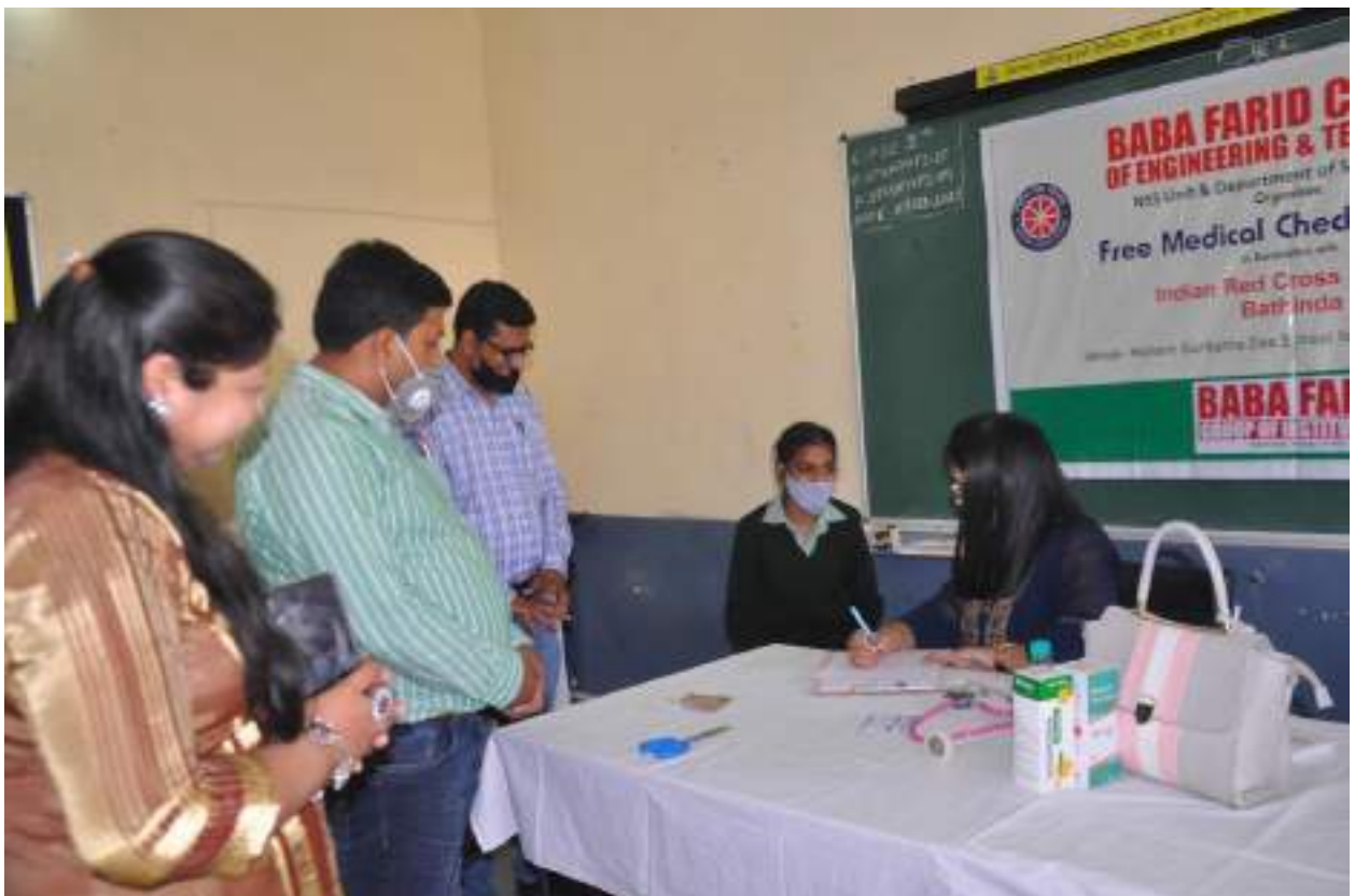
Doctors doing Check during the Camp