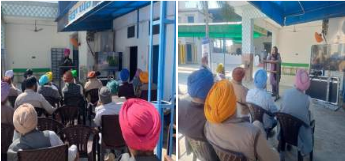
Glimpses of Awareness on Public Concerns