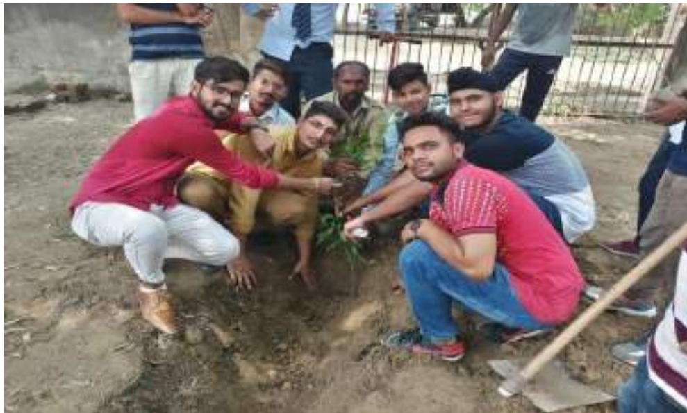
Volunteers planting the Saplings in village Peori during Tree plantation