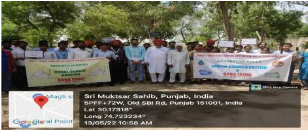
Awareness Rally on Water Conservation in Village Peori