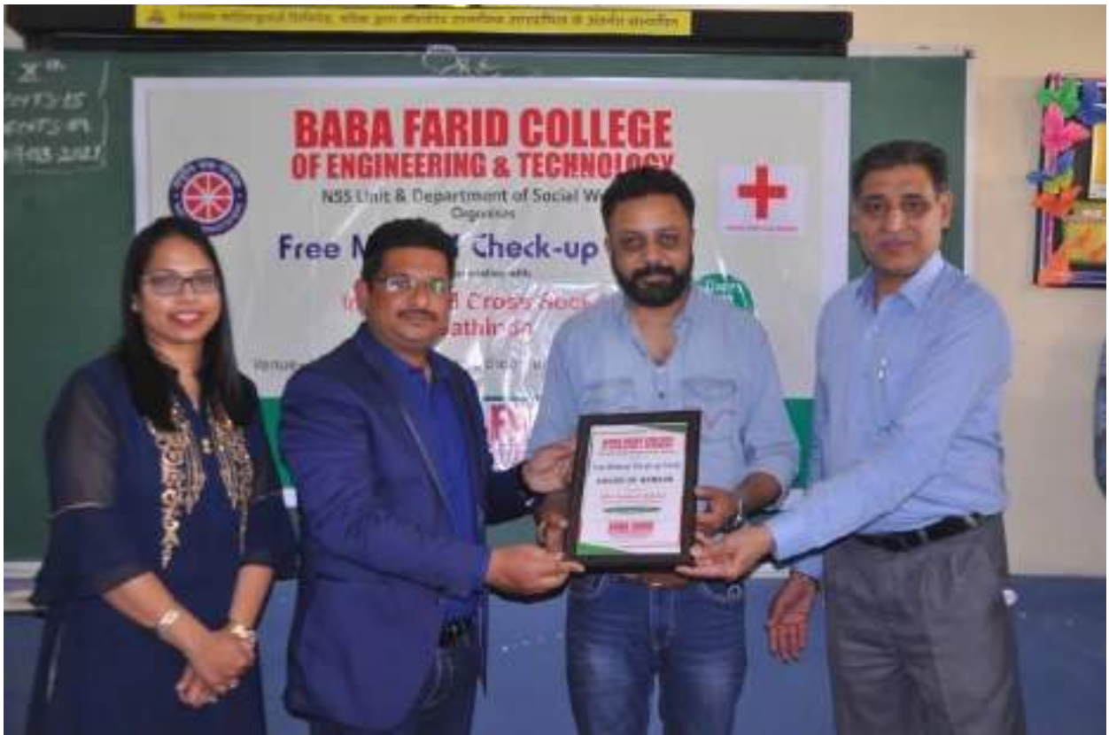
Honoring to Doctor of Chandigarh Hospital, Bathinda in a Camp