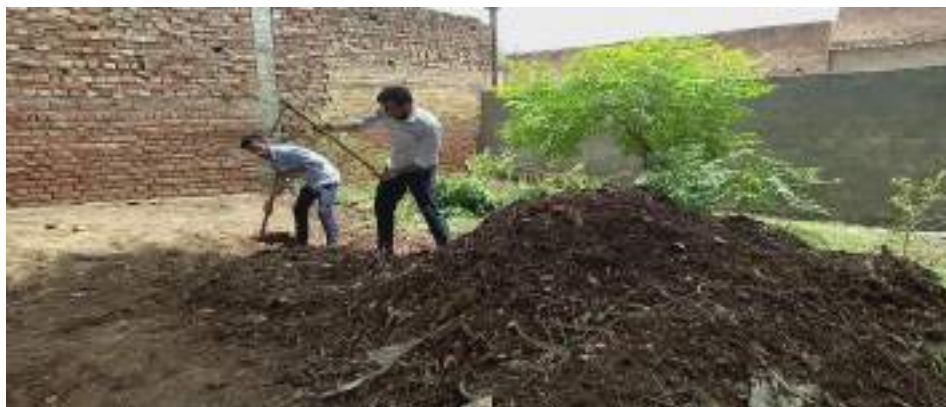
One Day Cleanliness Drive at Village Bhokhra: Volunteers cleans the surroundings