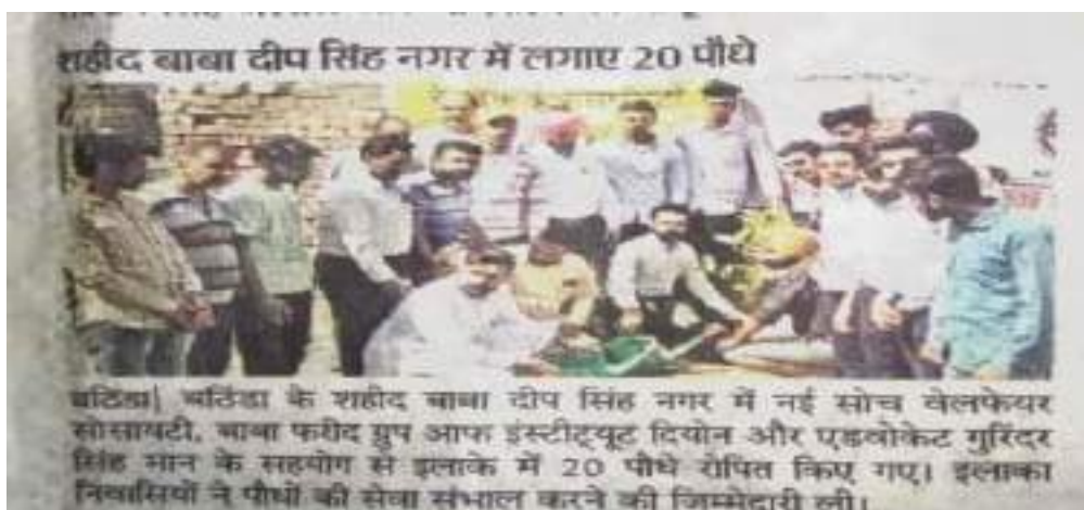
Media coverage of the event 'Greening Our Environment: A Tree-Planting Initiative'