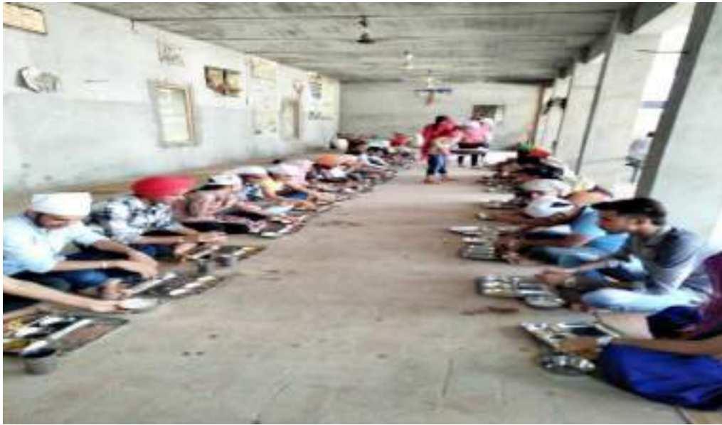
Volunteers serving the Guru Ka Langar in the Langar Hall of Dera Baba Sidh Tilkara, Deon