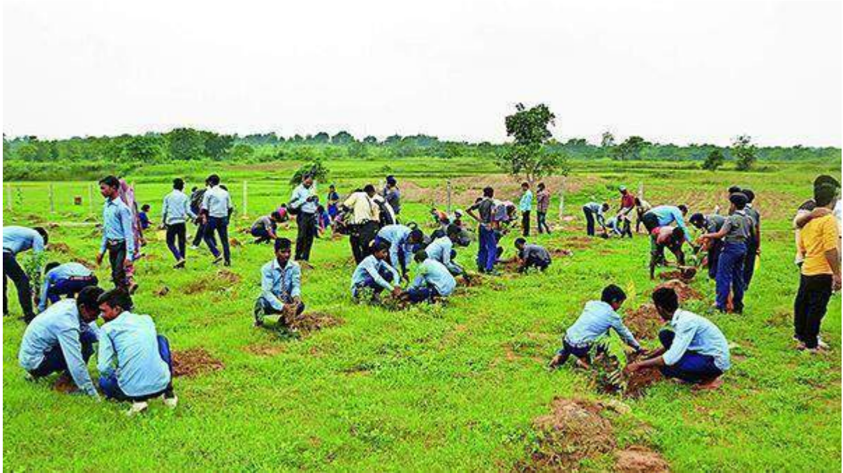
NSS/NCC volunteers during Tree Plantation at Village Deon

Deon village was a successful initiative that helped in promoting environmental awareness. It is important to continue organizing such initiatives to create a sustainable future and to encourage people to be responsible towards their environment.