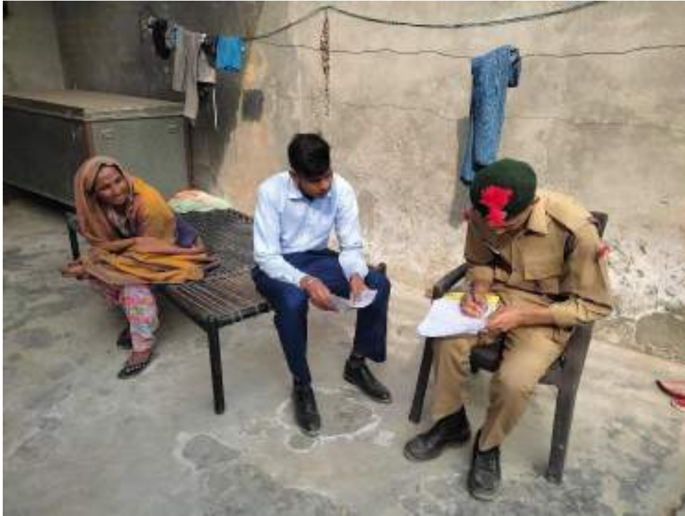
Glimpse of Household Survey under Unnat Bharat Abhyaan