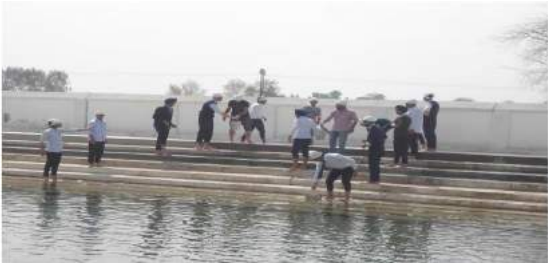
Cleanliness Camp at Gurudwara Thehri Sahib, Malout: Volunteers during the cleanliness of Gurudwara Sarovar Sahib

awareness talk. Moreover, our volunteers were enthusiastic to do more similar activities as it allowed them to connect to their community and made it a better place.