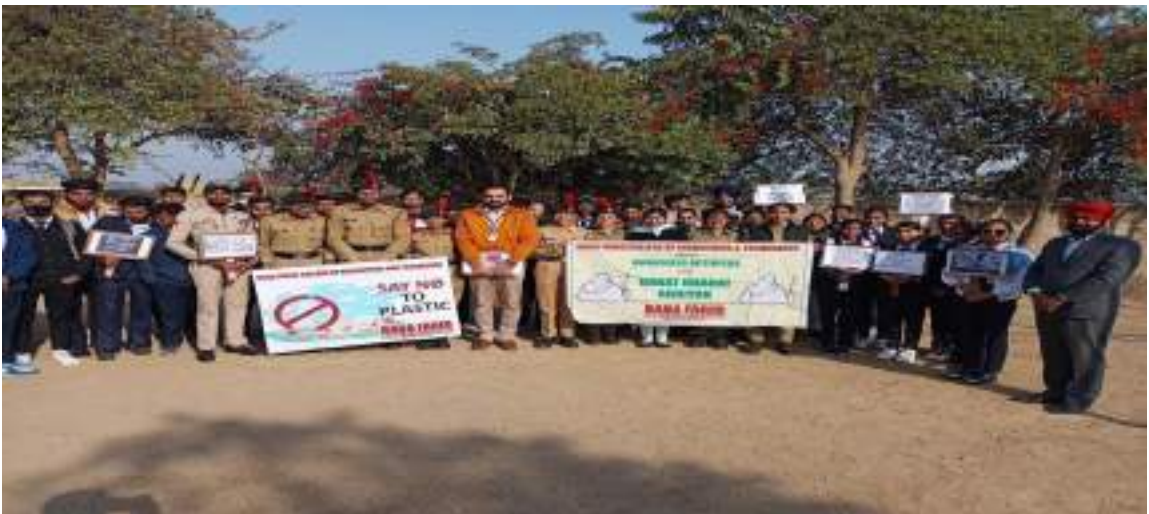
Glimpses of Awareness Rally on Say No to Plastic