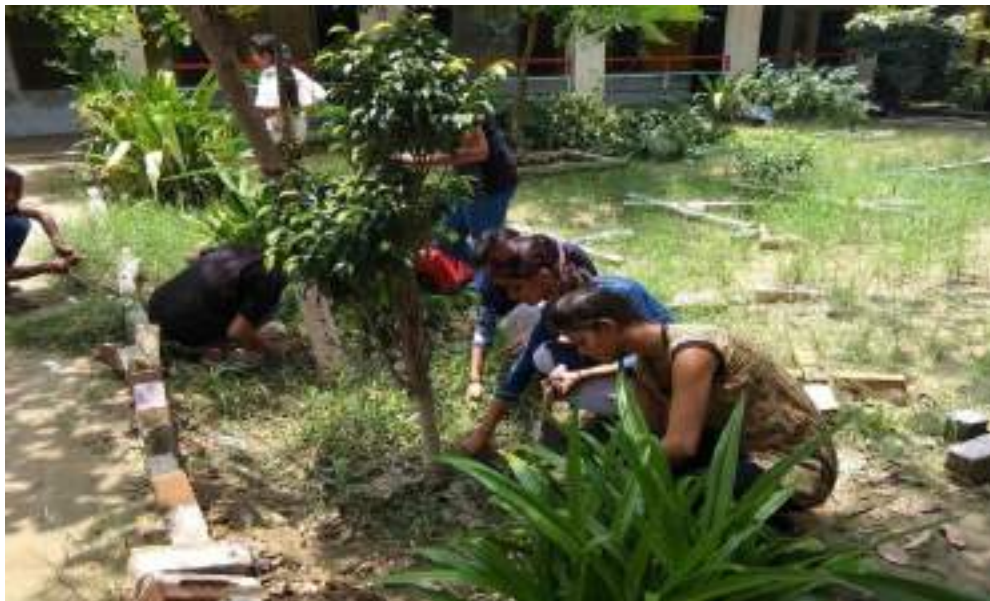
NCC Volunteers focusing on the need of maintaining Swachhta at Govt. Sen. Sec. School, Deon