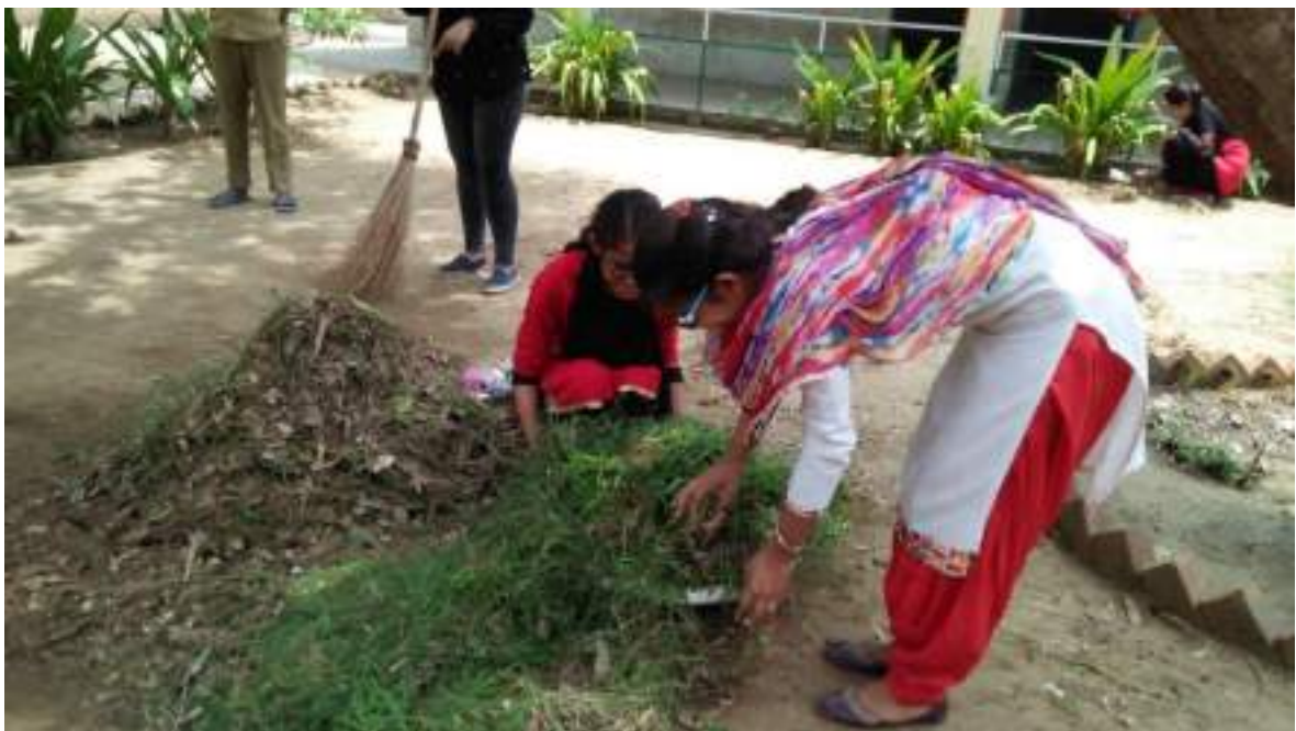
Volunteers Participating in Clean Sweep: Engaging in Community Cleanup Efforts