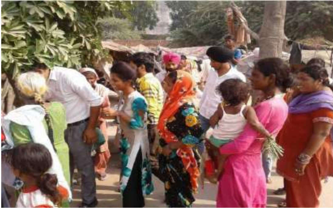
Distribution of Clothes to the Slum Dwells

members from various departments like Computer Science & Engineering, Civil Engineering, Information Technology, Mechanical Engineering, etc. joined hands together for being part of an important event as always.