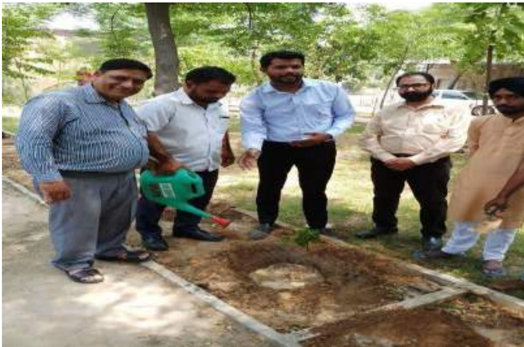
Volunteers planting the saplings in the village with help of the Local Residents