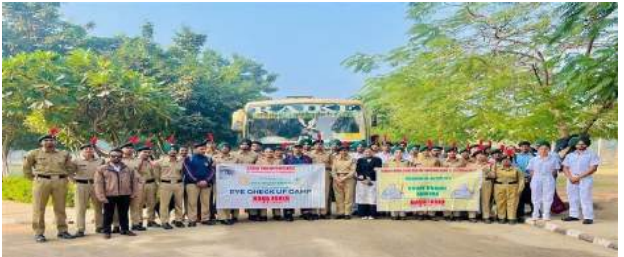
Group Photo of Volunteers