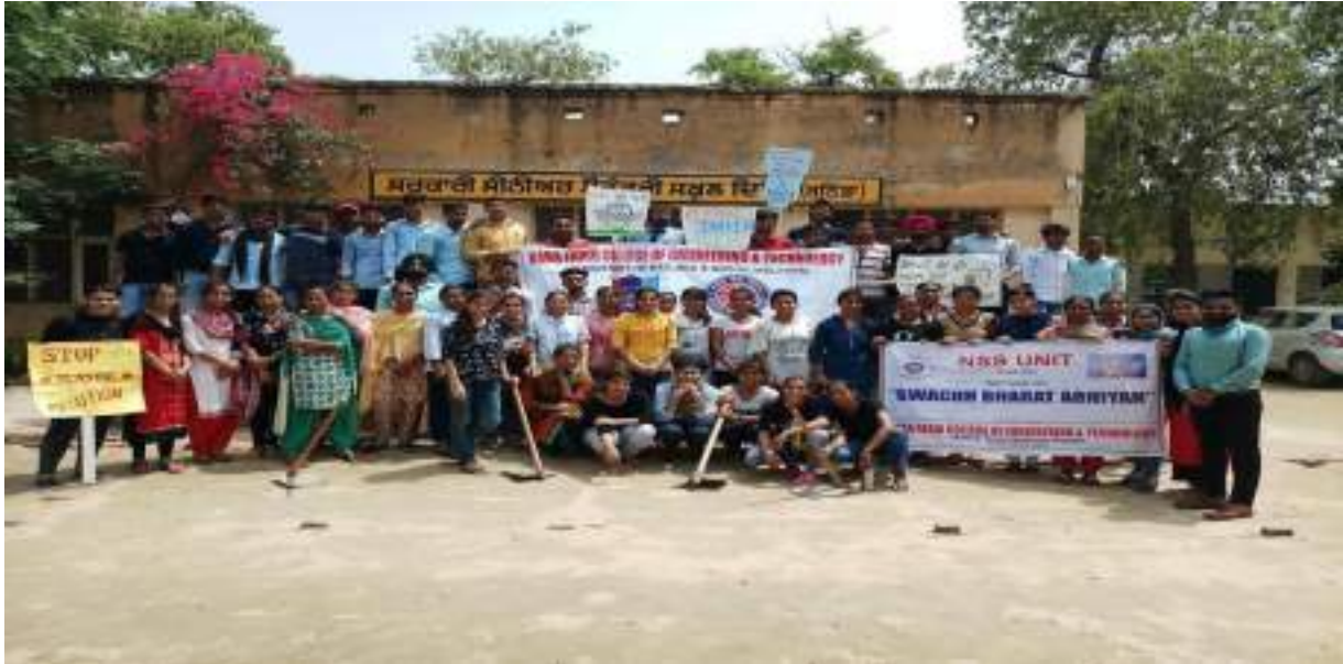
Volunteers after executing the Activity along with the school students