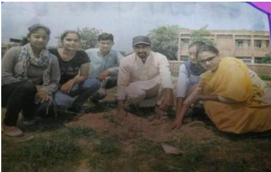
Volunteers planting the Trees in the village Makha